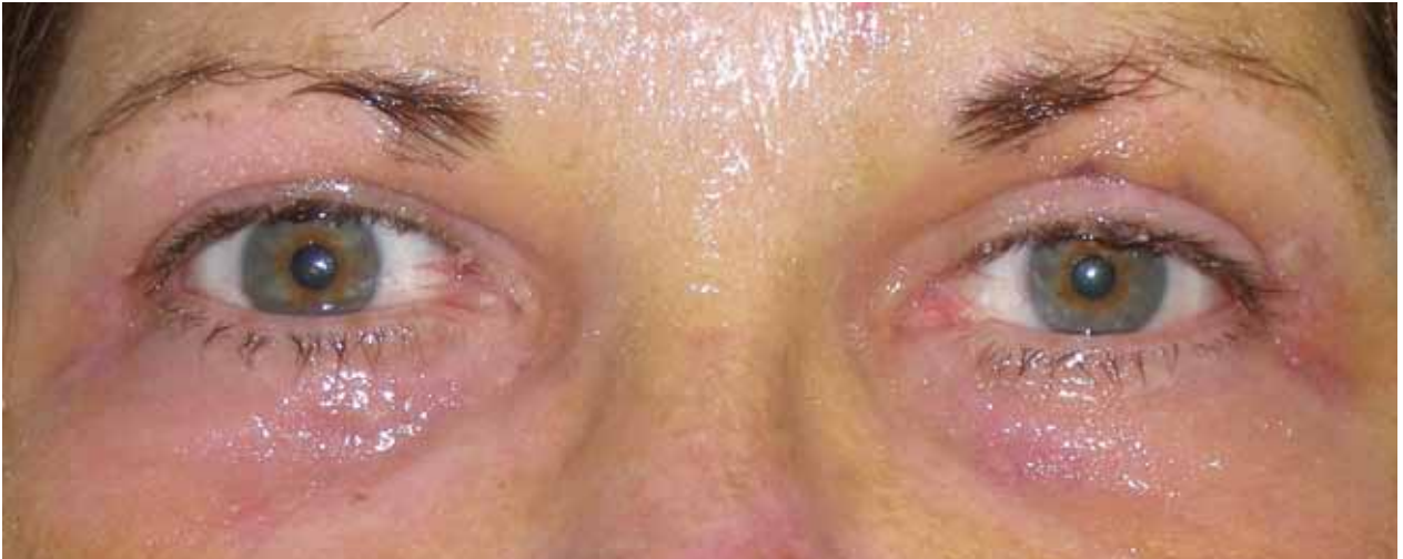
Figure 4. Patient 7 days after 2 high-fluence, high-density, nondebrided passes of the lower eyelids. Not all patients heal this quickly after aggressive CO 2 laser treatments, but this result is indicative of the faster rate of healing when not debriding the char between passes.

undergoes cutaneous aging manifested by wrinkling, texture changes, and dyschromia. Numerous surgical and nonsurgical techniques exist to address these issues.