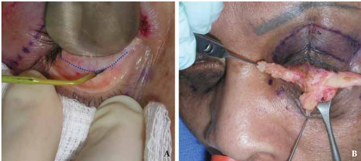
Figure 3. A typical transconjunctival incision using a radiowave microneedle that extends from the lacrimal punctum to the lateral canthus, approximately 4 mm below the inferior tarsus (A), with the medial central and lateral fat pads dissected intraoperatively (B).