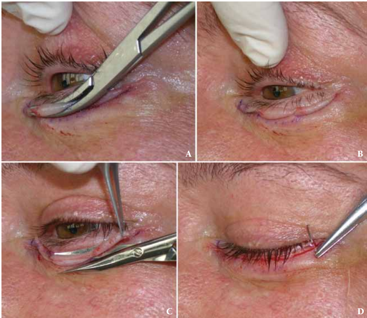
Figure 5. A hemostat pinching the excess skin of the lower eyelid (A), with the column of excess skin after the crushing maneuver (B). The column of excess skin is removed with scissors (C), while the postexcision wound is closed with 6-0 gut suture (D).

A trichloroacetic acid (TCA) 30% peel is another effective means of managing dermatochalasis of the lower eyelid. Patients are informed that the results of a TCA 30% peel are not as dramatic as the results of a laser but their recovery is less complicated. Again, wound care consists of only a petrolatum dressing. The dry wounds from the TCA 30% peel are easier for patients to endure than the raw laser wounds. Patients are informed that the peel can be repeated in 8 to 12 weeks to augment the results if needed.